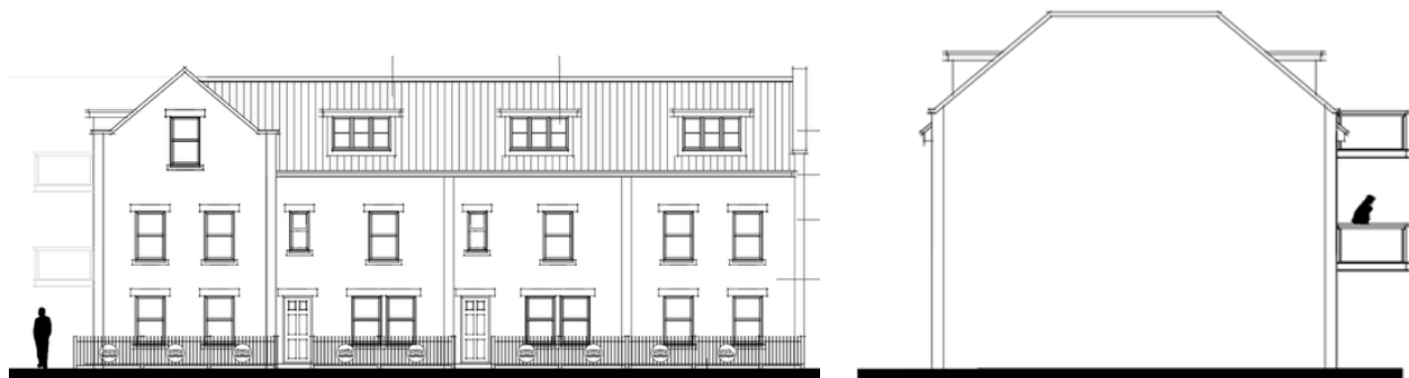
(Block A Plans and Elevations 21.038-020 - P21/07653/RM)

Regarding the doors on this elevation, it has been confirmed that they are 'False' doors for aesthetic purpose and, having reviewed the 'Block A Plans and Elevations 21.038-020' It does not appear that there is any requirement to create a step into the street. Essentially the plans demonstrate that the elevation will be flush with its connection to the pavement when view sideways on. I have attached these elevation drawings below for further reference.